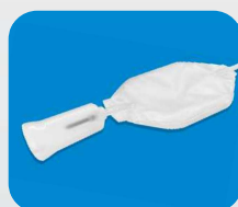
PDS Pre-donation Sampling Pouch**

Specification/Designs are subjected to change without any obligation on the part of the manufacturer