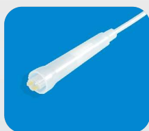
NPD Needle Protection Device**

Mitra Blood Bags are available with various combination of safety features including needle protection device and pre-donation sampling pouch with luer adapter.