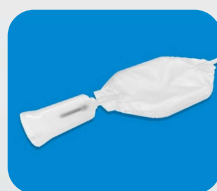
PDS Pre-donation Sampling Pouch**

Specification/Designs are subjected to change without any obligation on the part of the manufacturer